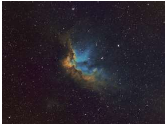
NGC 7380 (the Wizard Nebula) by Chuck Pavlick on 10/21/18.