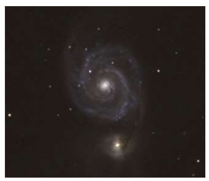
Photo of M51 (the Whirlpool Galaxy) taken by Lou Tancredi in April 2018.