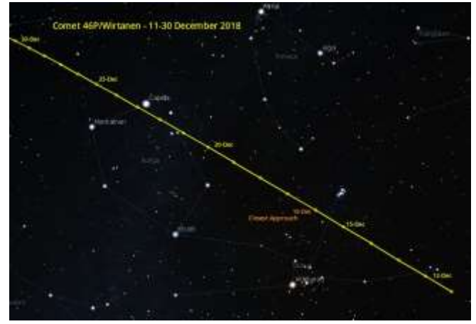
Comet 46P/Wirtanen (Path from 12/12/18-12/30/18)