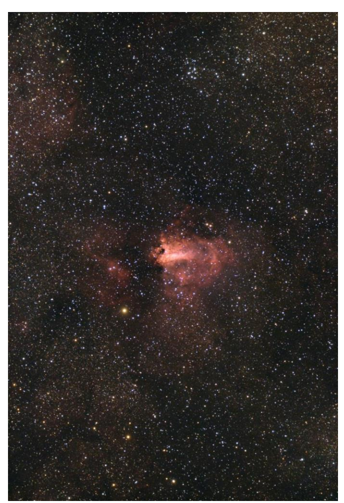
M17 taken through an 80mm EON; 8 @ 300 secs.