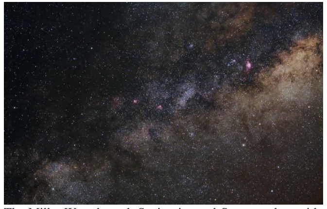
The Milky Way through Sagittarius and Scutum taken with a modified DSLR; 10 @ 120 secs.

I always wanted to get out to a very dark site (Bortal 2 on light pollution scale) and this year I had an opportunity to join Rick and Lori Piper in the SW corner of New Mexico at an RV park that accommodates astronomers. This is a couple of miles from the Arizona Sky Village. This area is not only noted for its dark