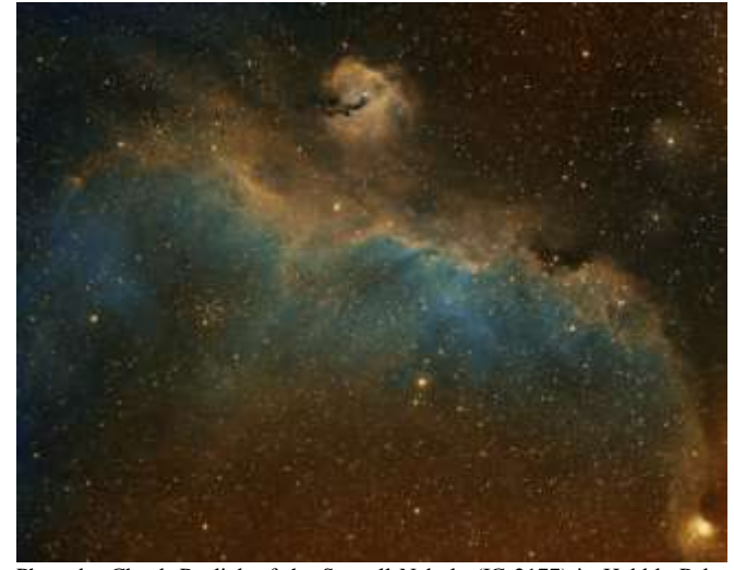
Photo by Chuck Pavlick of the Seagull Nebula (IC 2177) in Hubble Palette; Scope: Takahashi FSQ106 w/0.73 reducer; Camera: ASI 1600; Filters: Astrodon 7nm Ha, OIII and s2; Subs: Ha, OIII and s2 each 15@300 sec.; Captured in Nebulosity and processed in Pixinsight and Photoshop.