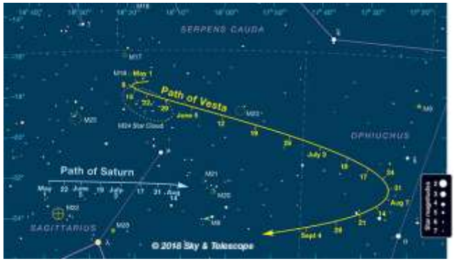
Sky map taken from Sky and Telescope Magazine.

be visible with a telescope until mid-September. Vesta reached opposition on June 19<sup>th</sup> (the closest it has been to Earth in over 20 years. See the above and below sky maps to help you find it. The below map shows where the asteroid will be on specific dates. Best viewing is on a moonless night. All we need is a clear, dark, bugless sky. That might happen in Florida, right?