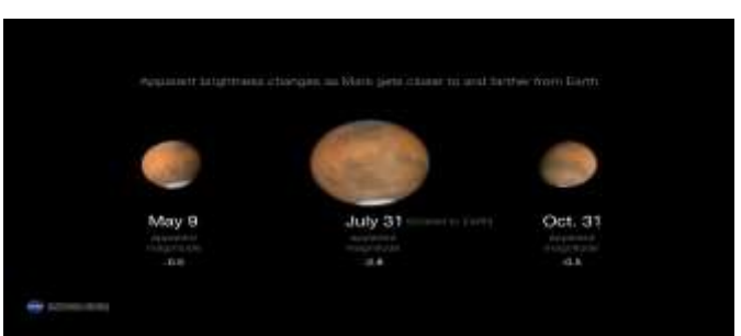
In 2018, Mars will appear brightest from July 27 to July 30. Its closest approach to Earth is July 31. That is the point in Mars' orbit when it comes closest to Earth. Mars will be at a distance of 35.8 million miles (57.6 million kilometers).

There is another important Mars date in July: Mars opposition. Mars opposition is when Mars, Earth and the Sun all line up, with Earth directly in the middle. This event is happening on July 27 this year.