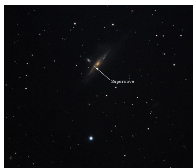
on 11/19/16 at the Fak. Supernova ATLAS16dvr in NGC 1532. Camera: Starlight Xpress SX25C; Scope: Celestron Edge 9.25 w/Lepus 0.62 Reducer; captured in Nebulosity and processed in Pixinsight and Photoshop; 6 at 120 seconds.