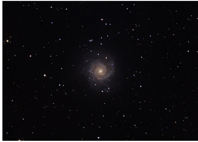
on 11/27/16 at the Fak. M74. Camera: Starlight Xpress SX25C; Scope: Celestron Edge 9.25 w/Lepus 0.62 Reducer; captured in Nebulosity and processed in Pixinsight and Photoshop; 11 at 420 seconds.