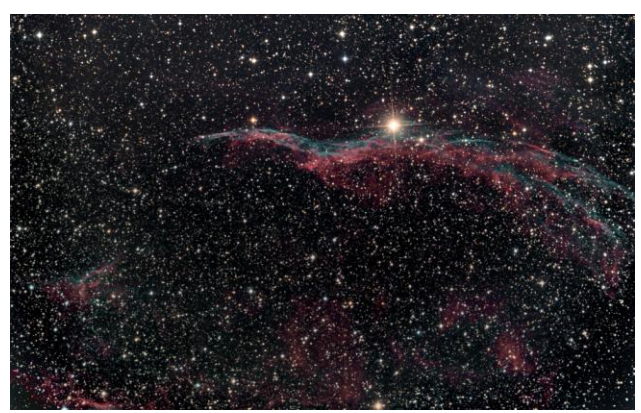
taken last month from the Nutwood Observatory, Ontario, Canada. NGC 6090 Cirrus Nebula (western strip of the Veil Nebula).