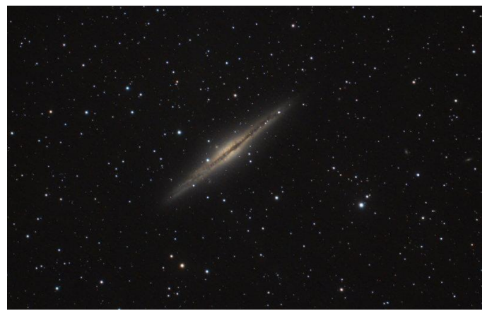
NGC 891 – Caldwell 23 by Chuck Pavlick taken at the Fak 12/12/15.