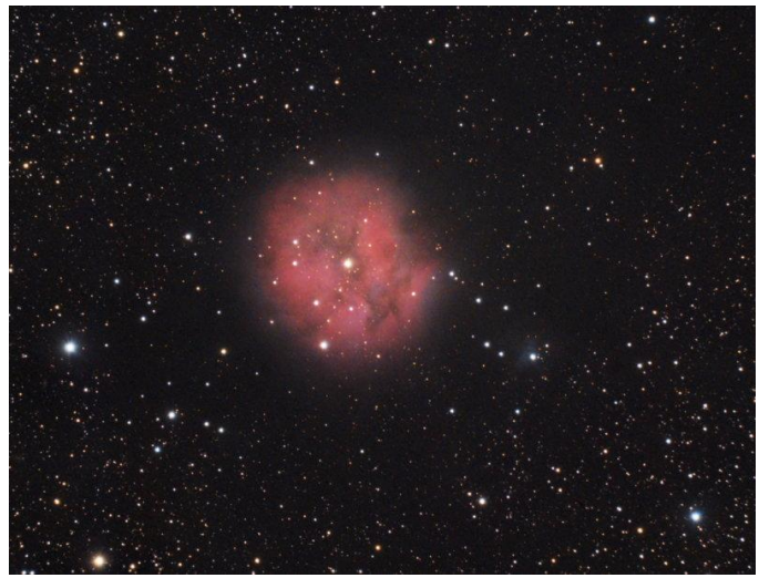
Cocoon Nebula by Chuck Pavlick taken at the Fak 12/12/15.