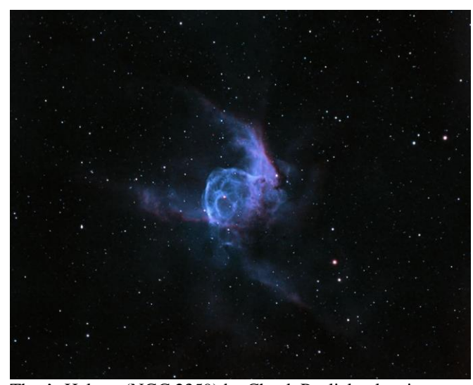
Thor's Helmet (NGC 2359) by Chuck Pavlick taken in March 2019.