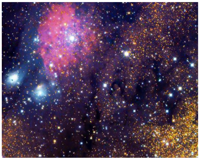
Here is a wonderful region in our galaxy which contains all the necessary ingredients for making entire solar systems. It is jammed with activity and features stars in the making, against a backdrop of very old yellow ones.

https://www.naplesnews.com/story/news/local/communities/collier-citizen/2019/03/29/looking-up-exploring-kitchen-making-stars-and-planets/3276504002/