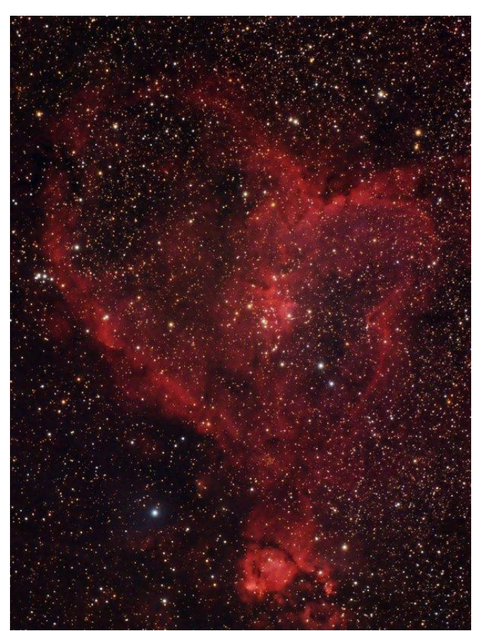
Heart Nebula taken by Chuck Pavlick on 11/29/13 at the Fak. Orion EON 72 w/field flattener; AP Mach 1, SBIG 8300c, 7 @ 720 seconds.